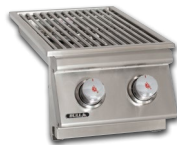
SLIDE-IN DOUBLE SIDE BURNER Item# 30008 (LP) - Item# 30009 (NG)