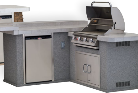
JR GOURMET Q™ Raised Bar