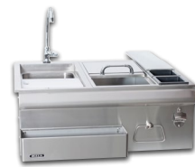
30" BAR CENTER Item# 97623