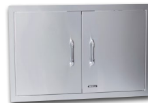
DOUBLE DOOR 25" Item# 33570, 30" Item# 33568 38" Item# 34000