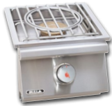
SLIDE-IN SINGLE PRO SIDE BURNER Item# 60018 (LP) - 60019 (NG)