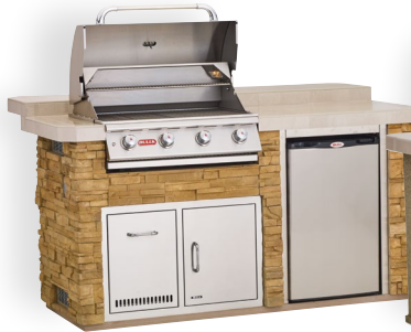
POWER Q™ Raised Bar