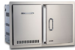
DOOR/PROPANE DRAWER COMBO Item# 65784