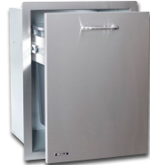
PULL OUT TRASH DRAWER Item# 56925