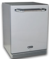
PREMIUM REFRIGERATOR 4.9 cu. ft. Outdoor Rated, Item# 13700