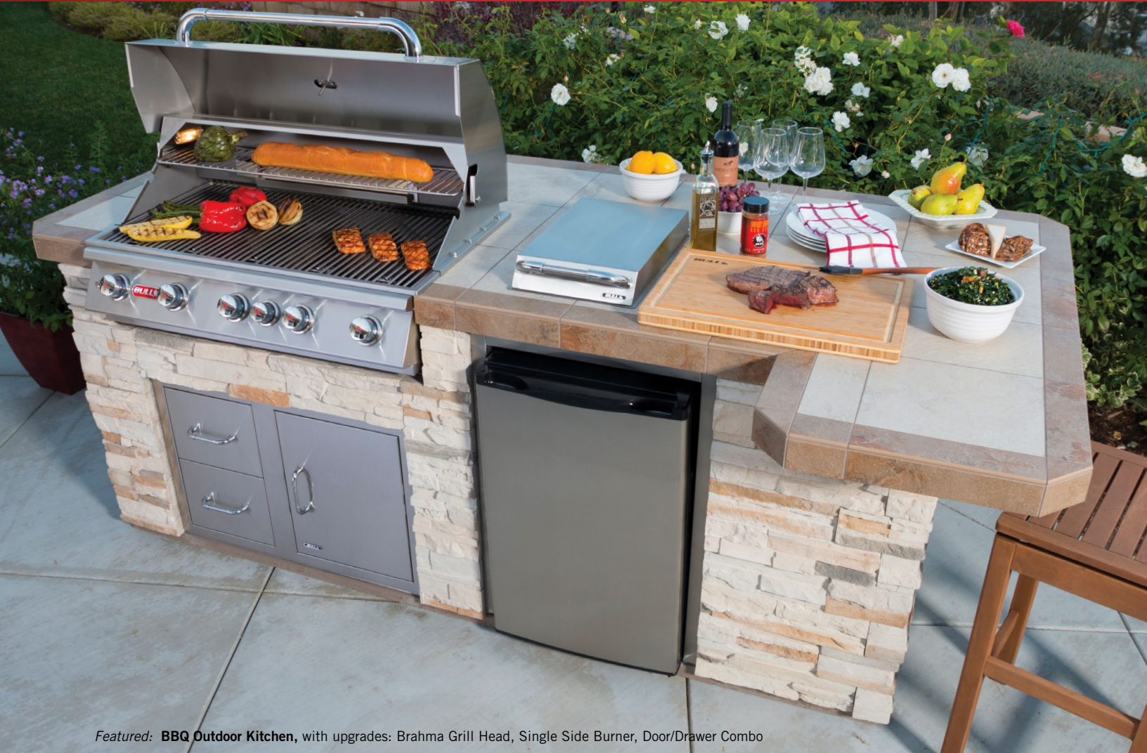
Featured: BBQ Outdoor Kitchen , with upgrades: Brahmi Grill Head, Single Side Burner, Door/Drawer Combo