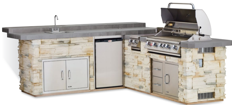
GOURMET Q™ Raised Bar