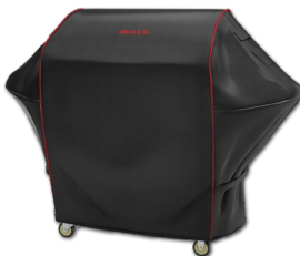
CART COVER All Cart and Grill Head covers available online