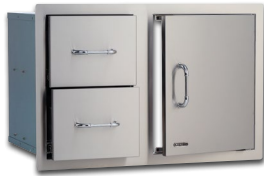
DOOR/DRAWER COMBO 30" Item# 25876, 38" Item# 55875