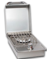
SINGLE SIDE BURNER Item# 60008 (LP) - 60009 (NG)