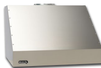
VENT HOOD - TWIN FAN Item# 66009 - 30" Grills Item# 66098 - 38" Grills