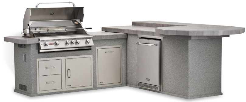
SUPREME Q™ Raised Bar