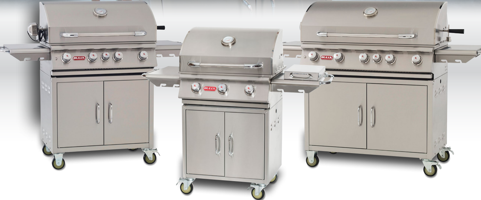
ANGUS™ GRILL CART