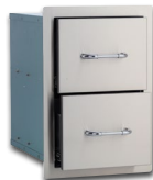
DOUBLE DRAWER Item# 56985