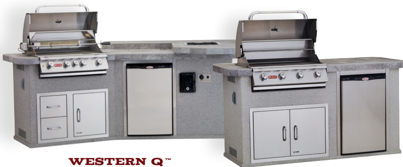
WESTERN Q™ Raised Bar