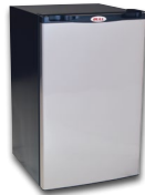
REFRIGERATOR 4.5 cu. ft. Item# 11001