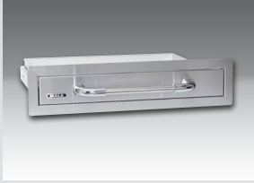
SINGLE DRAWER - Stainless Steel