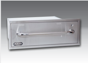
WARMING DRAWER - Stainless Steel

(Cutout - 28 1/2" W x 10" H x 20 1/4" D)