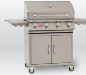
Item# 87001 LP Item# 87002 NG