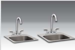
STAINLESS STEEL SINK & FAUCET

Sm.-(Cutout - 14 1/4" W x 7 5/8" H x 14 1/4" D)