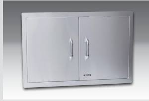
DOUBLE DOOR 30" - Stainless Steel

(Cutout - 31" W x 20" H x 2 1/4" D) Item# 33568