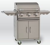
Item# 73008 LP Item# 73009 NG