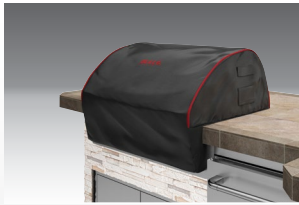
GRILL HEAD COVERS