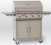
Item# 26001 LP Item# 26002 NG