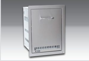
PROPANE DRAWER -Stainless Steel

(Cutout - 38" W x 20" H x 2 1/4" D) Item# 34000