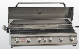
Item# 62648 LP Item# 62649 NG