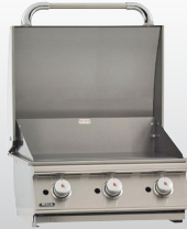
Item# 97008 LP Item# 97009 NG