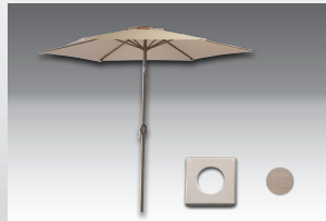
UMBRELLA 9' - Item# 32000