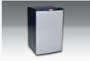
REFRIGERATOR 4.5 cu. ft. - Stainless Steel

(Cutout - 20 1/2" W x 33" H x 20 3/4" D)