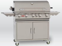
Item# 55000 LP Item# 55001 NG