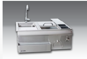
30" BAR CENTER -Stainless Steel