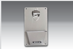
BOTTLE OPENER & CATCH