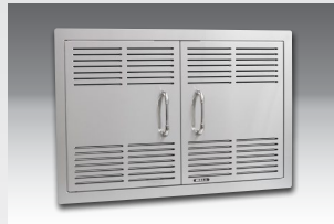
VENTED DOUBLE DOOR 30" Stainless Steel