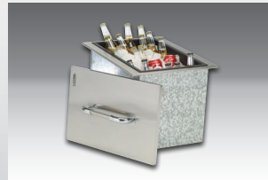
ICE CHEST -Stainless Steel

42" W x 25" H x 32" D Item# 66098 - 38" Grills