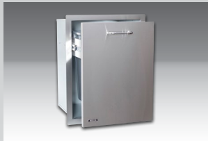
PULL OUT TRASH DRAWER - Stainless Steel

(Cutout - 18 1/4" W x 24 1/2" H x 16" D)