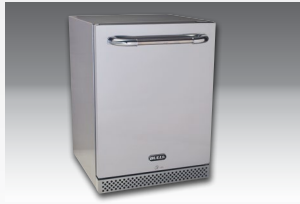
PREMIUM REFRIGERATOR 4.9 cu. ft.