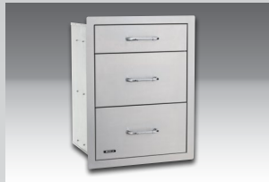
TRIPLE DRAWER SYSTEM - Stainless Steel

(Cutout - 18 1/2" W x 24 1/2" H x 16" D)