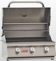
Item# 69008 LP Item# 69009 NG