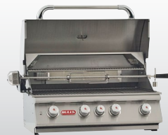
Item# 47628 LP Item# 47629 NG