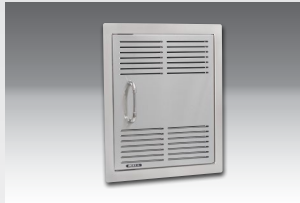
VENTED VERTICAL DOOR - Stainless Steel