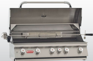
Item# 57568 LP Item# 57569 NG