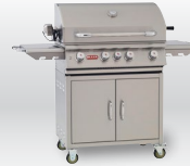
Item# 44000 LP Item# 44001 NG