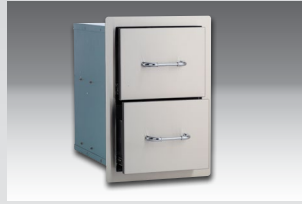
DOUBLE DRAWER - Stainless Steel

(Cutout - 12 3/4" W x 19 1/2" H x 20 3/4" D)