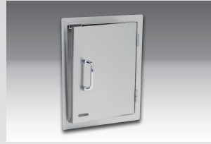
VERTICAL DOOR - Stainless Steel