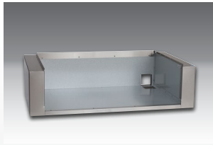
INSULATED GRILL JACKET - 30"

(Cutout - 37 7/8" W x 10" H x 22" D) Item# 47017