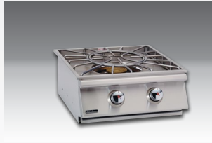
POWER BURNER - W/COVER