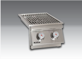
DOUBLE SIDE BURNER - SLIDE-IN W/COVER

(Cutout - 12 1/8" W x 9 1/2" H x 20 1/2" D)