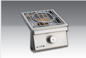
SINGLE SLIDE-IN PRO SIDE BURNER W/COVER

(Cutout - 12 1/8" W x 9 1/2" H x 20 1/2" D)