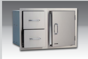
DOOR/DRAWER COMBO 30" Stainless Steel

(Cutout - 31" W x 20" H x 20 3/4" D) Item# 25876