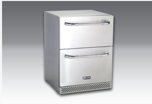
DOUBLE DRAWER REFRIGERATOR 5.0 cu. ft.