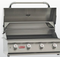
Item# 87048 LP Item# 87049 NG