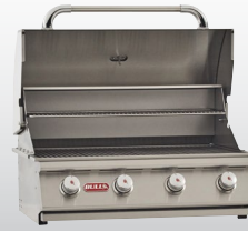
Item# 26038 LP Item# 26039 NG