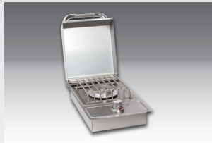
SINGLE SIDE BURNER - Stainless Steel

(Cutout - 11 1/4" W x 3 1/4" H x 17 1/2" D)