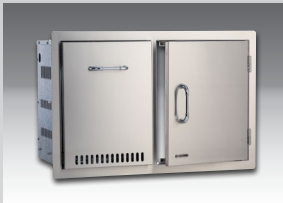
DOOR/PROPANE DRAWER COMBO