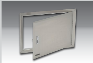
SINGLE DOOR LOCK & KEY

(Cutout - 38 1/2" W x 20" H x 20 3/4" D) Item# 55875